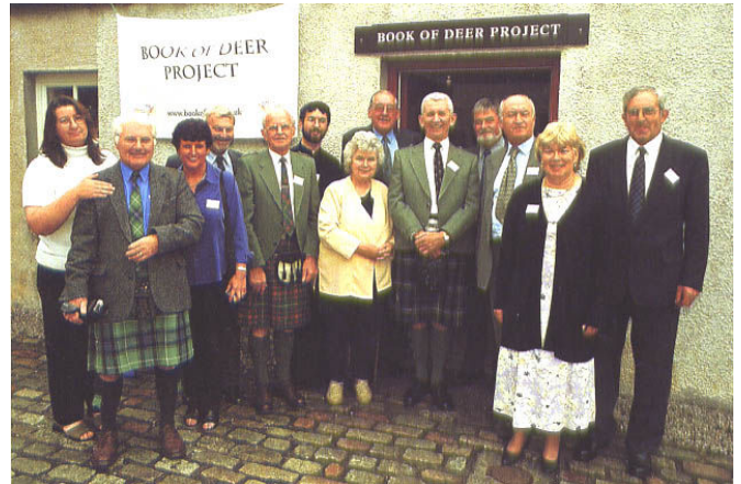
A proud day-the opening of the Book of Deer Heritage Centre