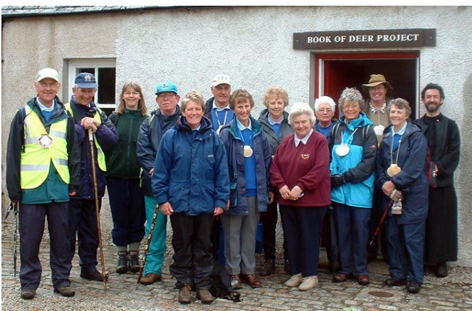
Happy faces at the end of The 2004 Pilgrimage.